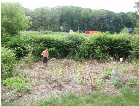
Figure 36 , to the left, shows the BWA's student intern from ESU on May 30, 2009, attempting to fight back the knotweed that was re-invading the cleared patch.

BWA undertook to do that follow-up, with the help of a student intern hired for the summer.