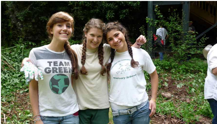
Figure 33. Young volunteers at Buck Hills Falls Invasive removal clean up, May 2010.

In addition, a selection of native shrubs was planted to replace the knotweed. Then on June 13 th five BHF residents attended a presentation and interpretive hike on invasive plants given by Lori. Garlic mustard, stiltgrass and especially Japanese barberry were noted, along with a wide variety of native plants.