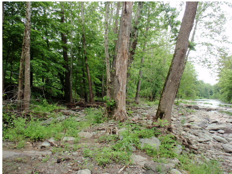
Figure 29 , above right, shows the condition of the cleared section on June 12, 2011. Very few knotweed have returned. In the distance, knotweed can be seen all along the uncleared section downstream from the cleared site.

An April 2010 inspection showed the knotweed to have been very effectively treated—less than 10% of plants regrowing. The barberry and multiflora that were treated appeared to be dead. The remnant thorny stems, however, proved to be an obstacle to fishermen unless removed. BWA invasive plant specialist, Lori Colgan, attended the April 2010 inspection of the previous removal attempt and emphasized the importance of following the instructions from the herbicide manufacturer and NPS to minimize contamination of the creeks.