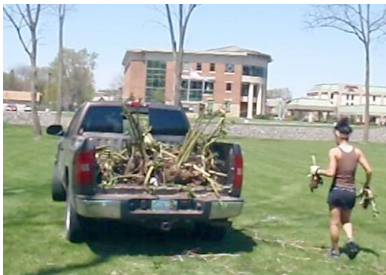
Figure 38 . With the help of BWA volunteers, the knotweed stalks were taken to a nearby landfill.